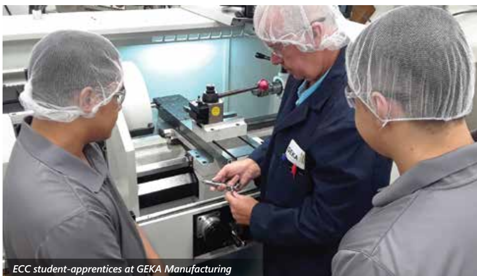
ECC student-apprentices at GEKA Manufacturing