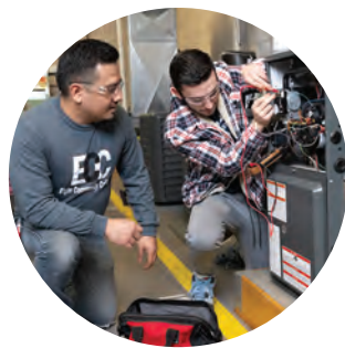
HVAC/Green Energy Career