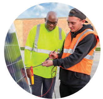
Solar Photovoltaic Installers