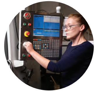
Computer-Numerical Control (CNC) Programmers and Quality Control Specialists

Some form of post-secondary education is required for 37% of in-demand manufacturing occupations. Only 41% of workers in Illinois have the education and training to fill middle-skill jobs like those in advanced manufacturing fields. ECC's Manufacturing and Technology Center will train the future workforce, close equity gaps for under-represented and under-resourced families and individuals, and create career pathways for our diverse community to enjoy success and contribute to our economy both now and for years to come.